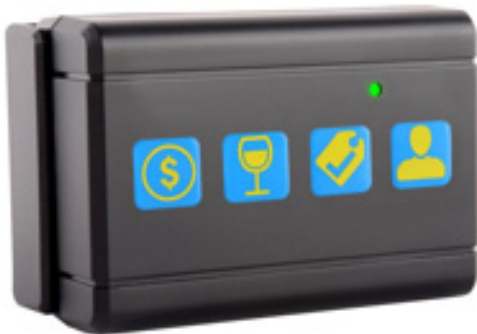
Sample cashier button. Customize button's colors, graphics, back-lighting and other options. Use Proxidyne Platform and your radios to play custom announcements for each button press.