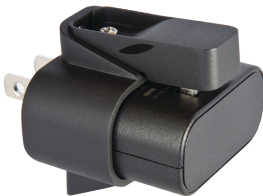
Bleu Station Series 100 Beacon shown with optional security bracket.