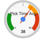
Real Time Data