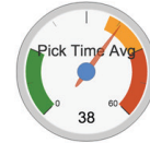
Real Time Data